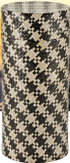
Palm Black/Tan 1700L