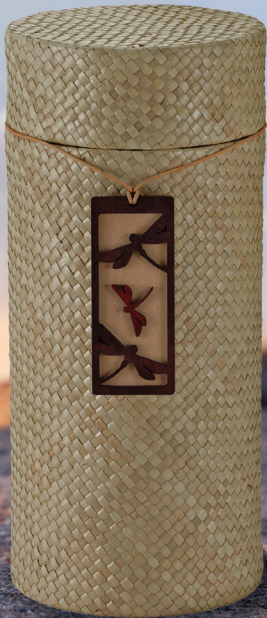
Palm Tan 1701L (shown with 400030 Woodland Pendant)

Woven Naturals are made from all natural woven materials. Size, color, and appearance may vary slightly.